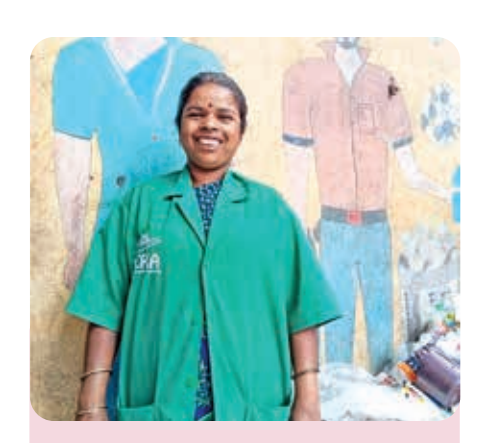
5 ACTIVE COMMUNITY ECOLOGY PROJECTS