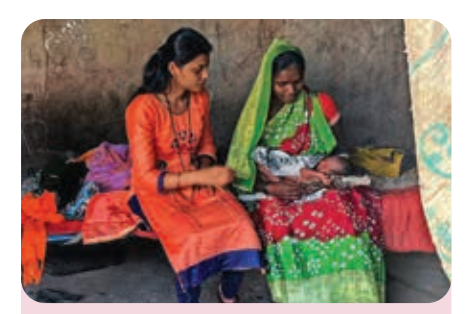
150,000 YOUNG AND EXPECTANT MOTHERS WERE POSITIVELY IMPACTED

Over 50,000 students were covered through TalentNext, a large-scale program combining digital skilling for final year college students and capacity building for college faculty. In addition, 850+ faculty from 300+ engineering and science colleges across India participated in faculty development programs.