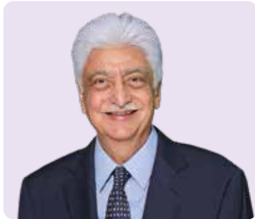
Azim H. Premji Founder Chairman