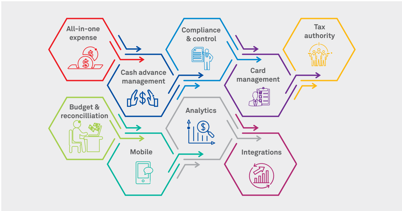
Fig1 : Solution overview

manages the complete-end-to-end expense management process. Besides, managing company policies and controlling expenses is extremely challenging and shifts the company's focus from core business activities to managing budget and expenses. This leads to longer reimbursements cycle and skewed reports and dashboards.