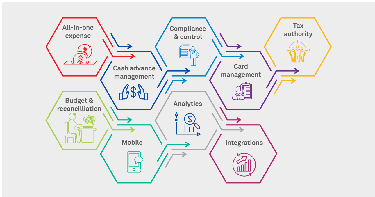
Fig1 : Solution overview

manages the complete-end-to-end expense management process. Besides, managing company policies and controlling expenses is extremely challenging and shifts the company's focus from core business activities to managing budget and expenses. This leads to longer reimbursements cycle and skewed reports and dashboards.