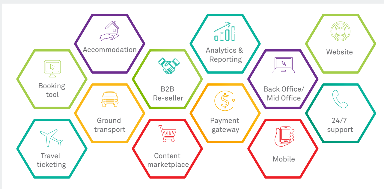
Figure 1: Solution overview

Wipro Way2Go – a one-stop travel offering for travel management companies: