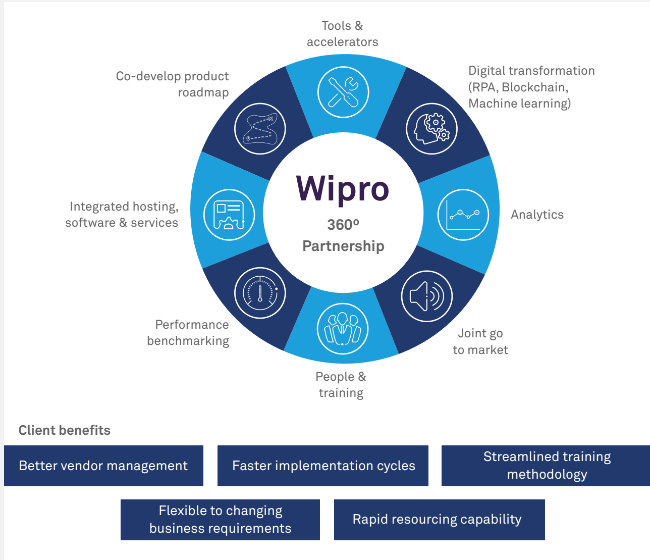
Figure 4: 360° partnership for well defined benefits

Wipro's 360-degree partnership model is a win-win proposition for our clients and partners with its well defined benefits.