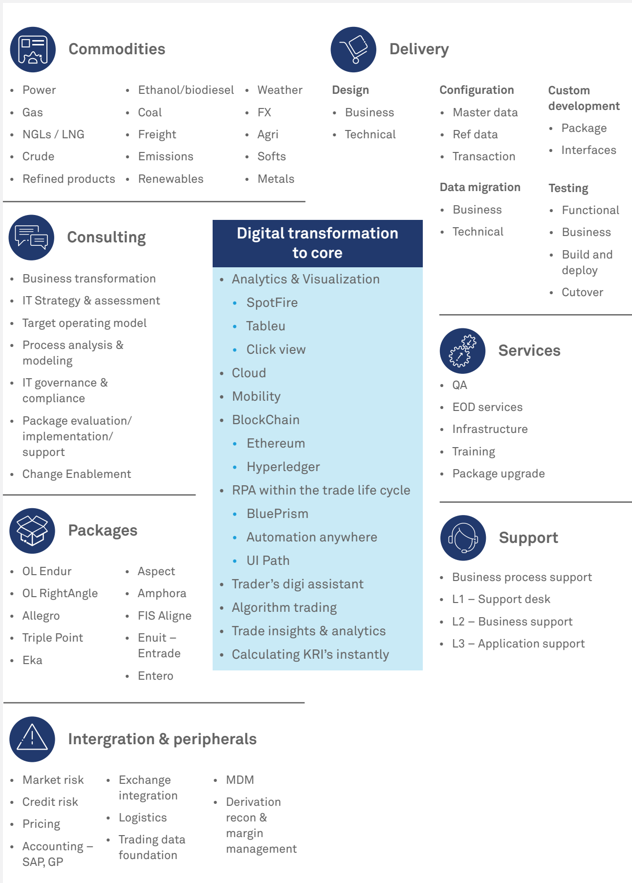
Figure 3: Services offered in energy and commodities