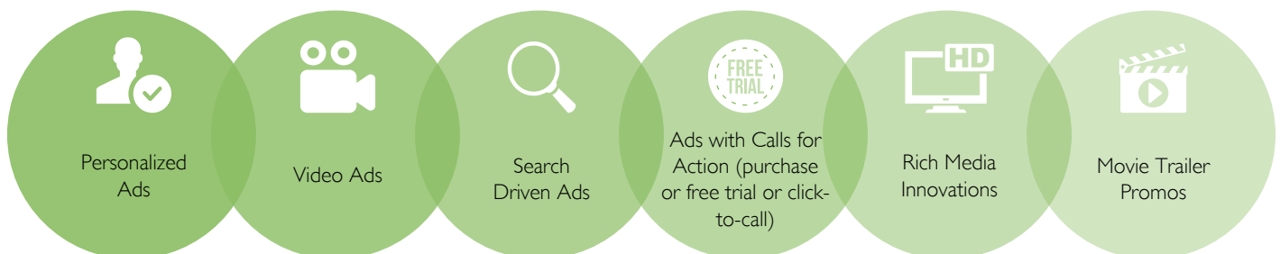
Figure 2: Multi-Screen Ad Innovations

Integrated Inventory Management. The proposed ad platform provides increased accuracy and visibility across a set of complex, overlapping