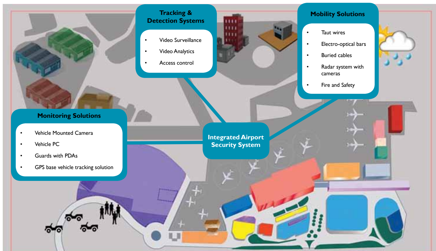
Figure 2: Integrated Airport Security System

A truly integrated airport security system typically encompasses three main elements – Monitoring, Tracking & Detection and Mobility solutions. These aspects are linked together by the fourth element - a Command and Control Center to mitigate risk across the airport environment by providing actionable intelligence and enabling speedy security incident resolution.