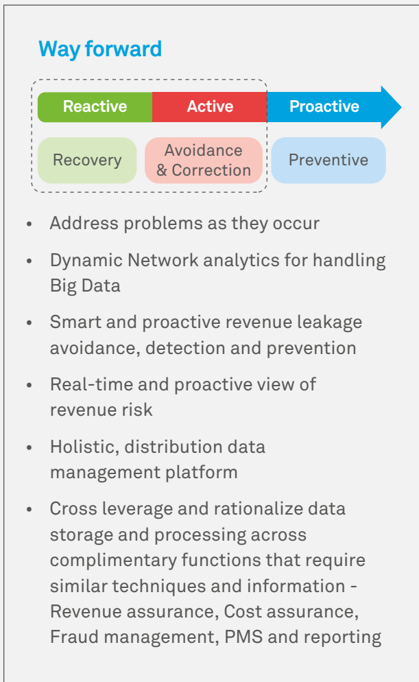
Figure 3: A Proactive Approach to Revenue Assurance