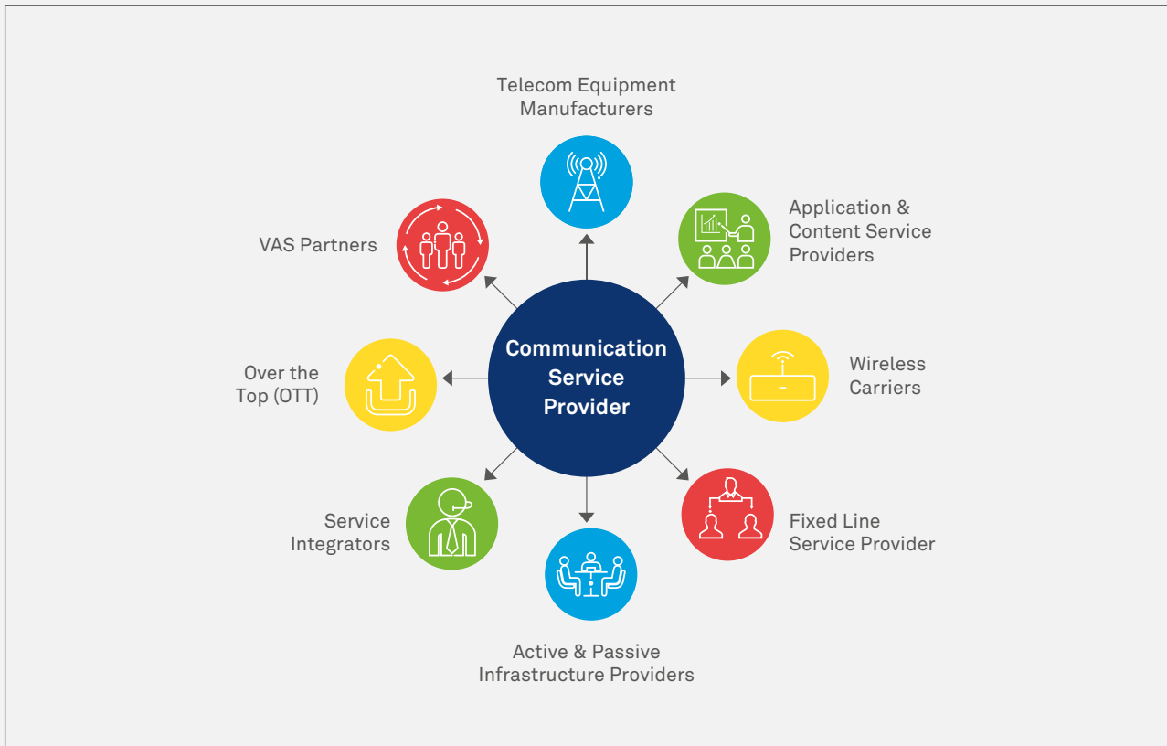
Figure 1: The Modern Telecom Eco-system

A typical telecom operator has multiple partnerships for audio and video content, marketing, m-commerce, gaming, Over-the-top services, Internet of Things (IoT), customer analytics, Cloud computing, etc., over wireline, 2G, 3G, 4G, and LTE networks (Figure 1: Modern Telecom Eco-System). While these partnerships are good news from a growth perspective, revenue assurance has become a matter of urgent concern.