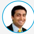
Rishad Premji Chief Strategy Officer & Member of the Board