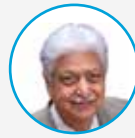
Azim H. Premji Chairman