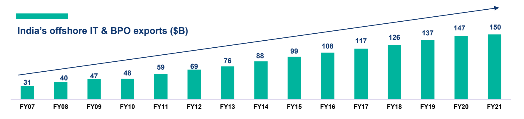
CAGR of 11%