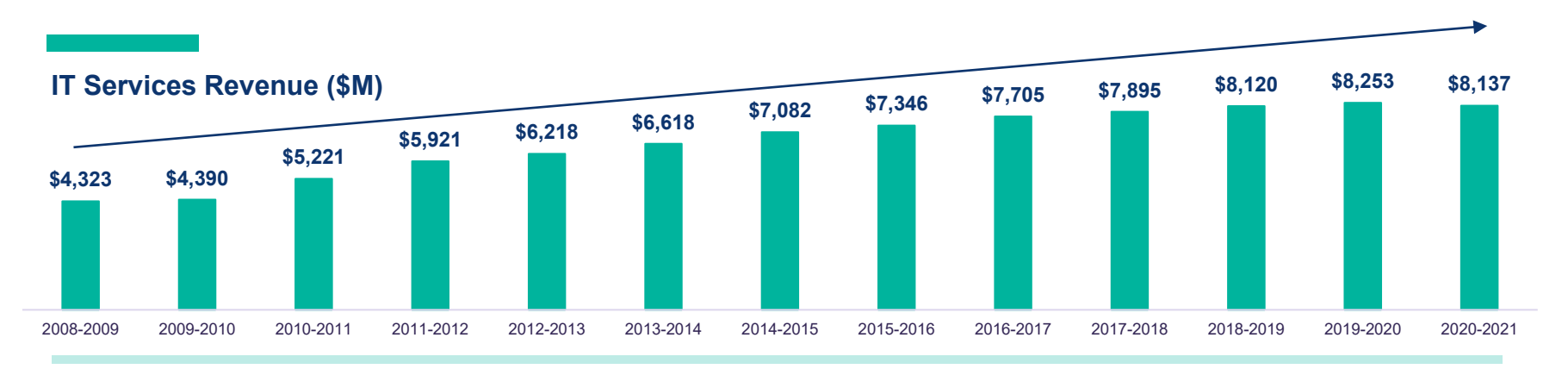
IT Services Business has grown at a CAGR of over 4.5% in the last 10 years*