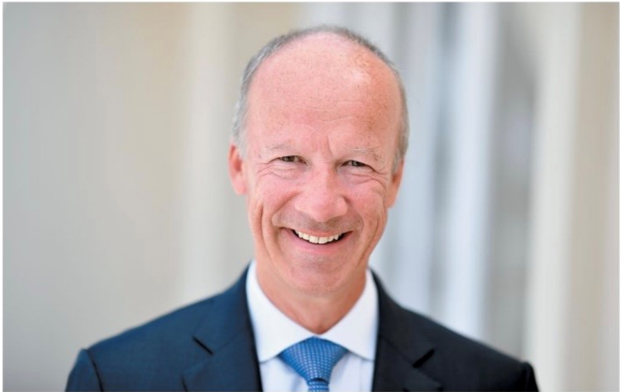
Since joining on July 6, Wipro's CEO and MD Thierry Delaporte has already conducted 130 interviews with the company's key clients