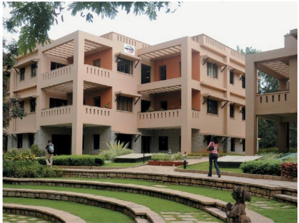
The Wipro headquarters in Bengaluru

However, it may take Wipro some time to get used to the new organisation and governance. Market recoveries are important times during which market shares can shift, and once they are over,