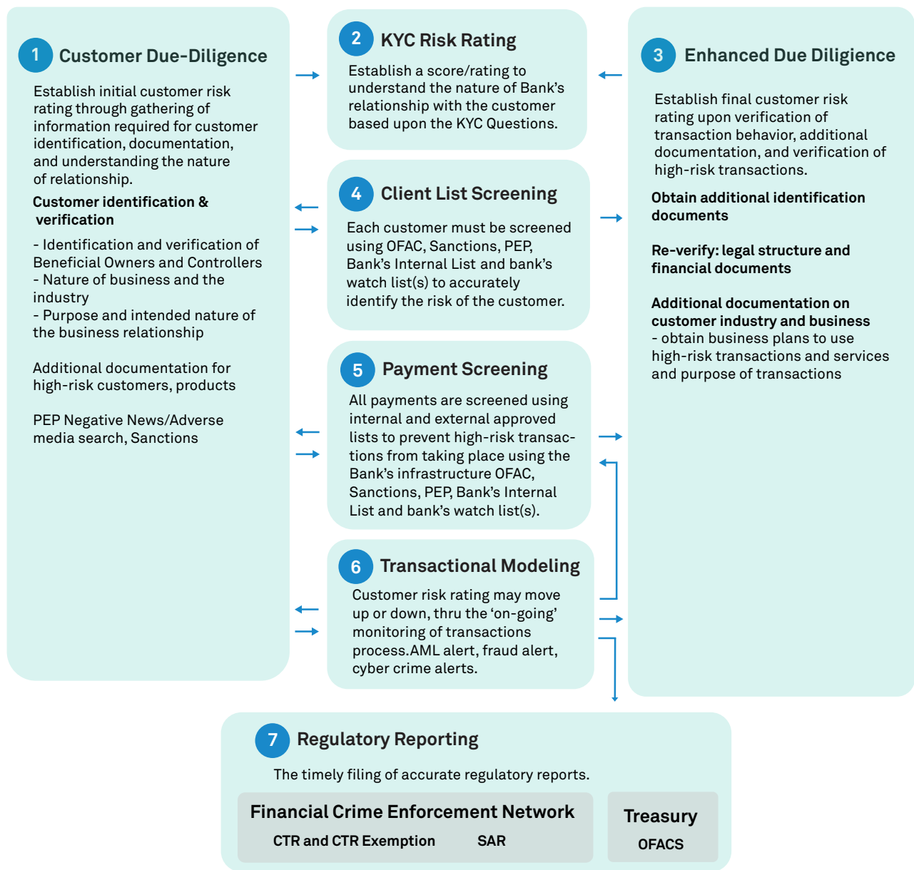
Figure 2: Model of an integrated architecture supporting financial crime compliance for KYC, AML, fraud and cyber.